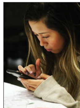
(LEFT) One Avenue Scholar focuses on how to determine her upcoming schedule of classes at MCC.