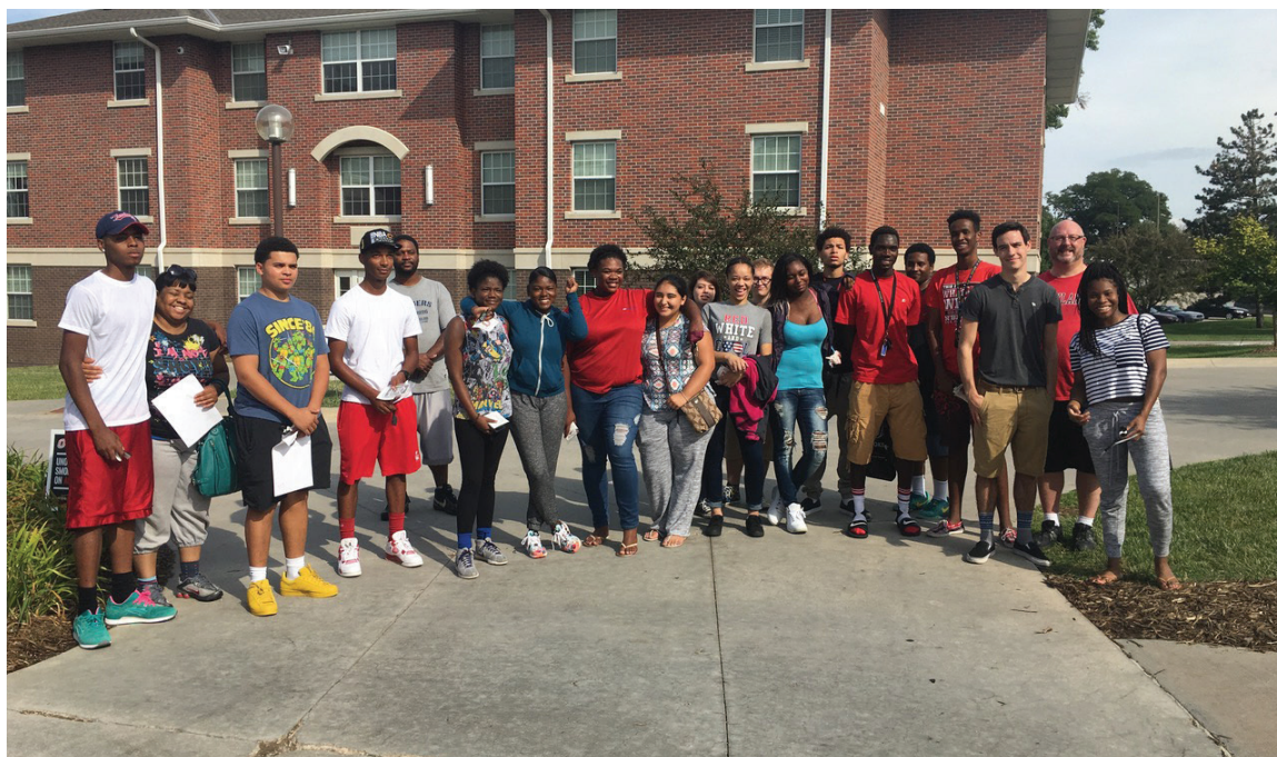
A group of happy Avenue Scholars gathers in front of University Village on the University of Nebraska at Omaha campus.