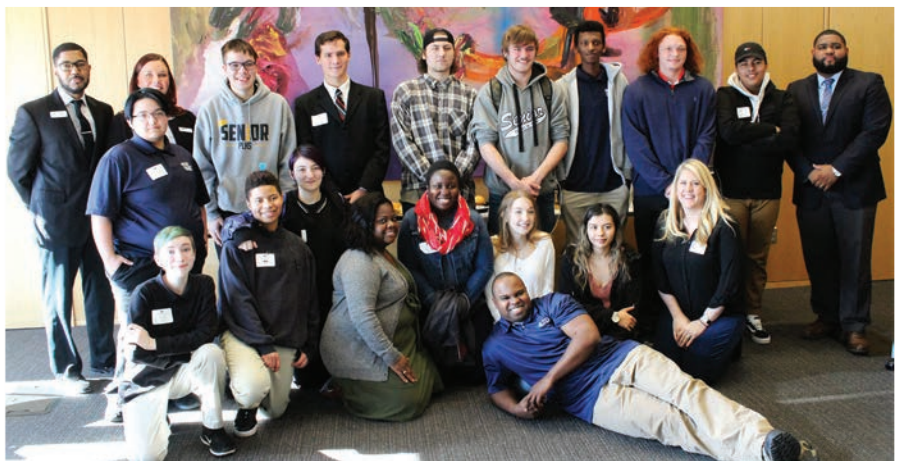
Papillion LaVista Scholars and ASF staff pose staff at Security National Bank after a Mock Interview session.