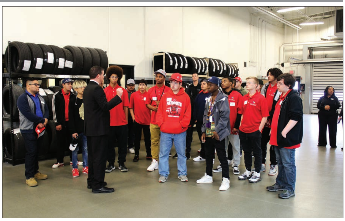
Avenue Scholars listen closely to introductory remarks during a Career Exploration Event at Baxter Auto.

The events explored careers in the fields of Information Technology, Auto/Diesel, Trades, Auto Technology, Healthcare, Business, and Auto Collision.