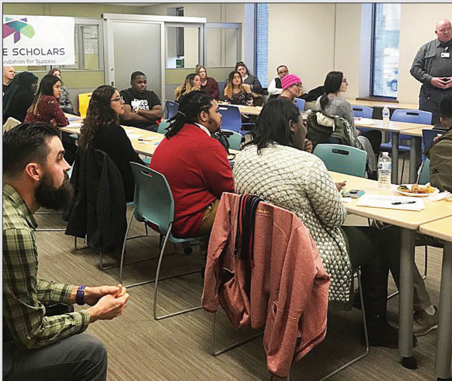
Avenue Scholars Foundation students and staff listen to presentations from employers during a Network event, held at ASF offices Jan. 31.