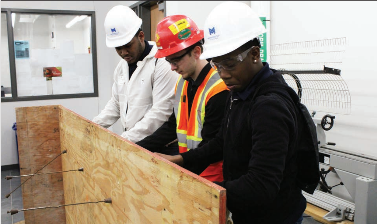
Avenue Scholars participate in hands-on activities during a Career Exploration event at the Fort Omaha Campus during the 2017-2018 school year.