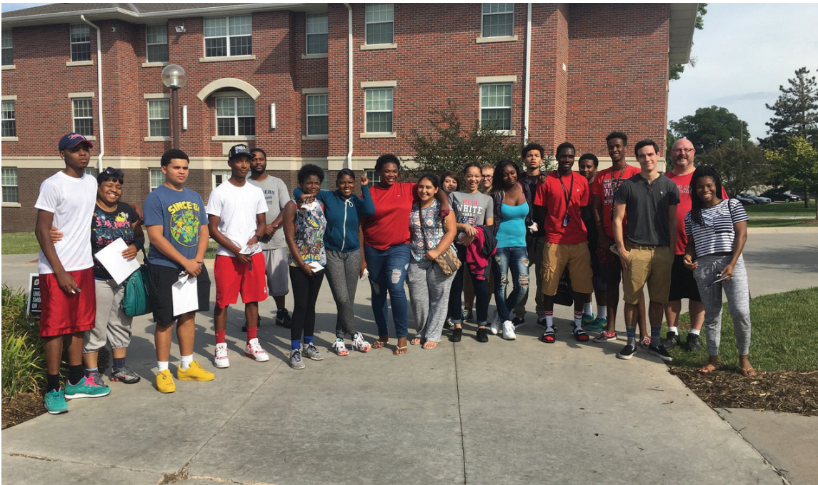
A group of happy Avenue Scholars gathers in front of University Village on the University of Nebraska at Omaha campus.