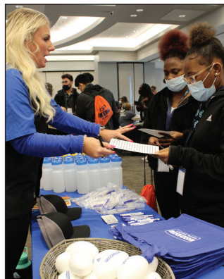
Avenue Scholars students (TOP) fill out forms to determine which job recruiters they want to visit during the Intern Omaha Expo. Other students (ABOVE AND LEFT) listen to recruiting pitches from employers.