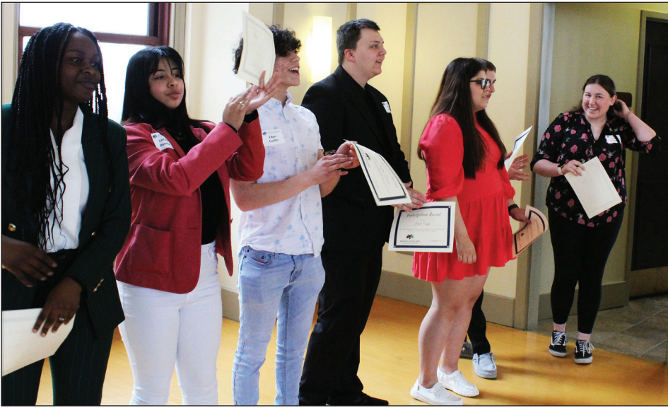
Millard North students applaud one of their classmates who received a Special Recognition honor.