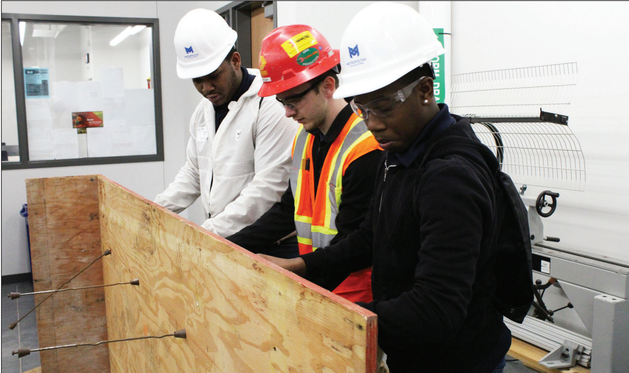
Avenue Scholars participate in hands-on activities during a Career Exploration event at the Fort Omaha Campus during the 2017-2018 school year.