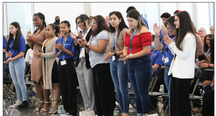
A group of Avenue Scholars applauds classmates as they are recognized during the Boot Camp graduation ceremony, held at the Fort Omaha Campus of Metropolitan Community College.