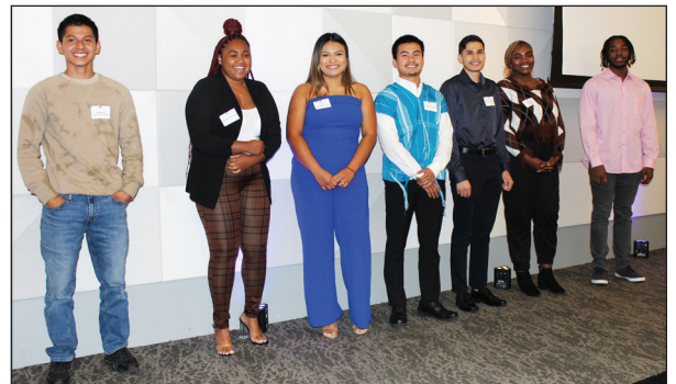
(ABOVE) Several Avenue Scholars alumni pose for a group photo after receiving special recognition honors.