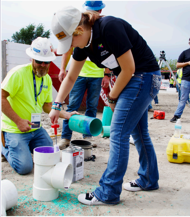
In September, Scholars attended the Equipment Rodeo at Valley Corporation where they played games, asked questions, and took part in career-specific activities related to skilled trades.