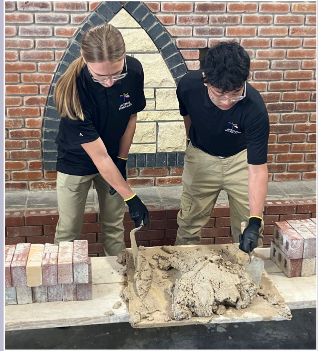
Scholars attended a Career Awareness event at the Bricklayers Union Local 15 Chapter 1 this October where they discovered benefits of the industry and tested their skills with trowels and laying bricks.

Learn more about business partnerships. Scan the QR code or email businessoutreach@avescholars.org