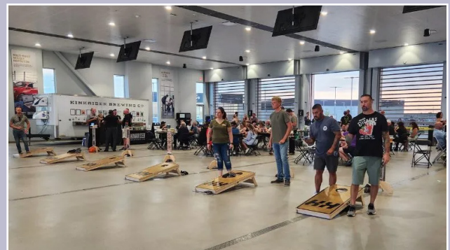
Above: Participants in The H+H Group Cornhole Tournament Fundraiser at the All Chevy & MOPAR Show.

We extend our gratitude to The H+H Group for their generosity and for making a difference in our community!