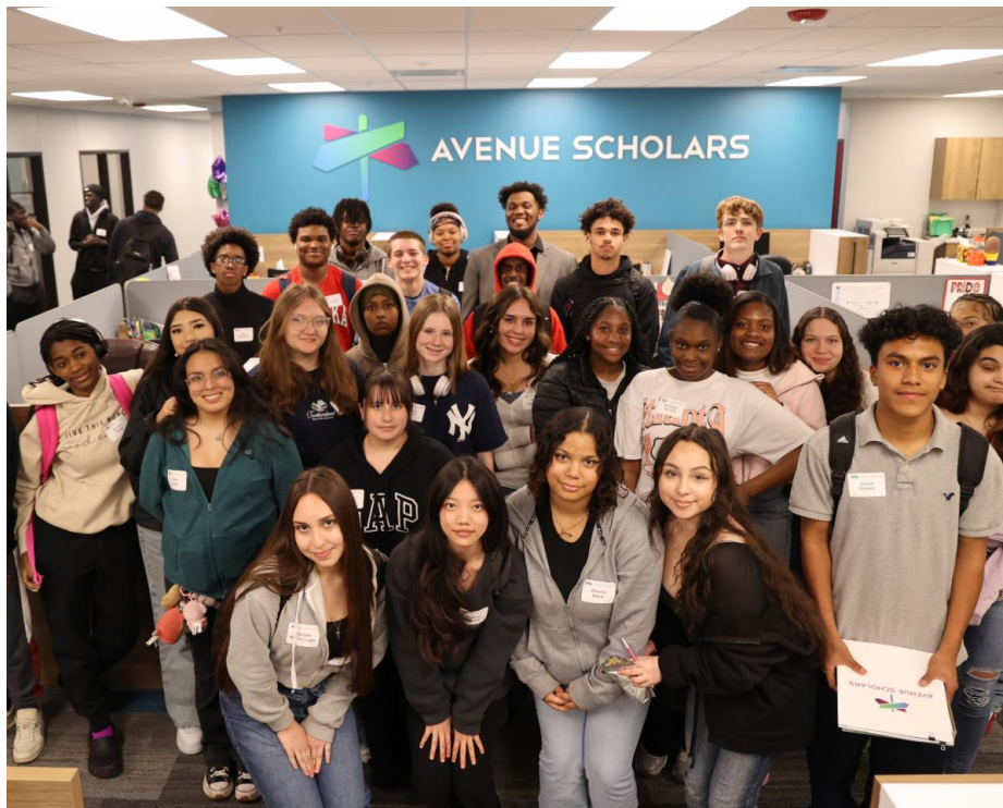
Photo: These Westview High School students will make history as the first Scholars from their school to join the Avenue Scholars program, beginning Fall 2025.

We welcomed incoming juniors and seniors from 10 high schools at events throughout April